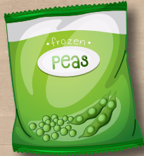
FROZEN FOOD BAGS