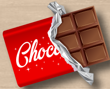
CANDY BAR WRAPPERS