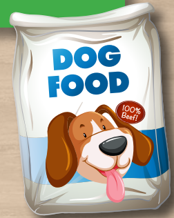
PET FOOD BAGS